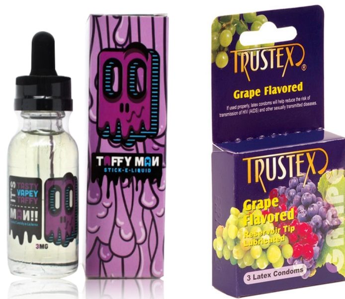
Vape flavors and condom flavors designed to appeal to teens.